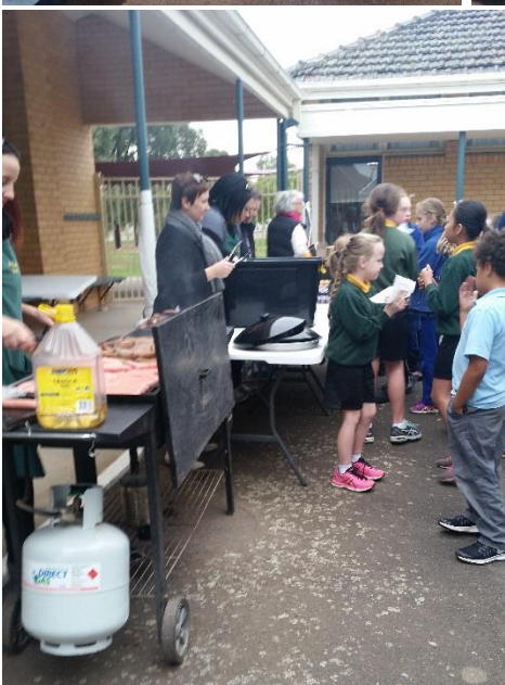
"Strive For the Greater Gifts" Catholic Education Cluster Day held at Charlton yesterday with students and staff from St. Patrick's St Arnaud and St Joseph's Charlton.